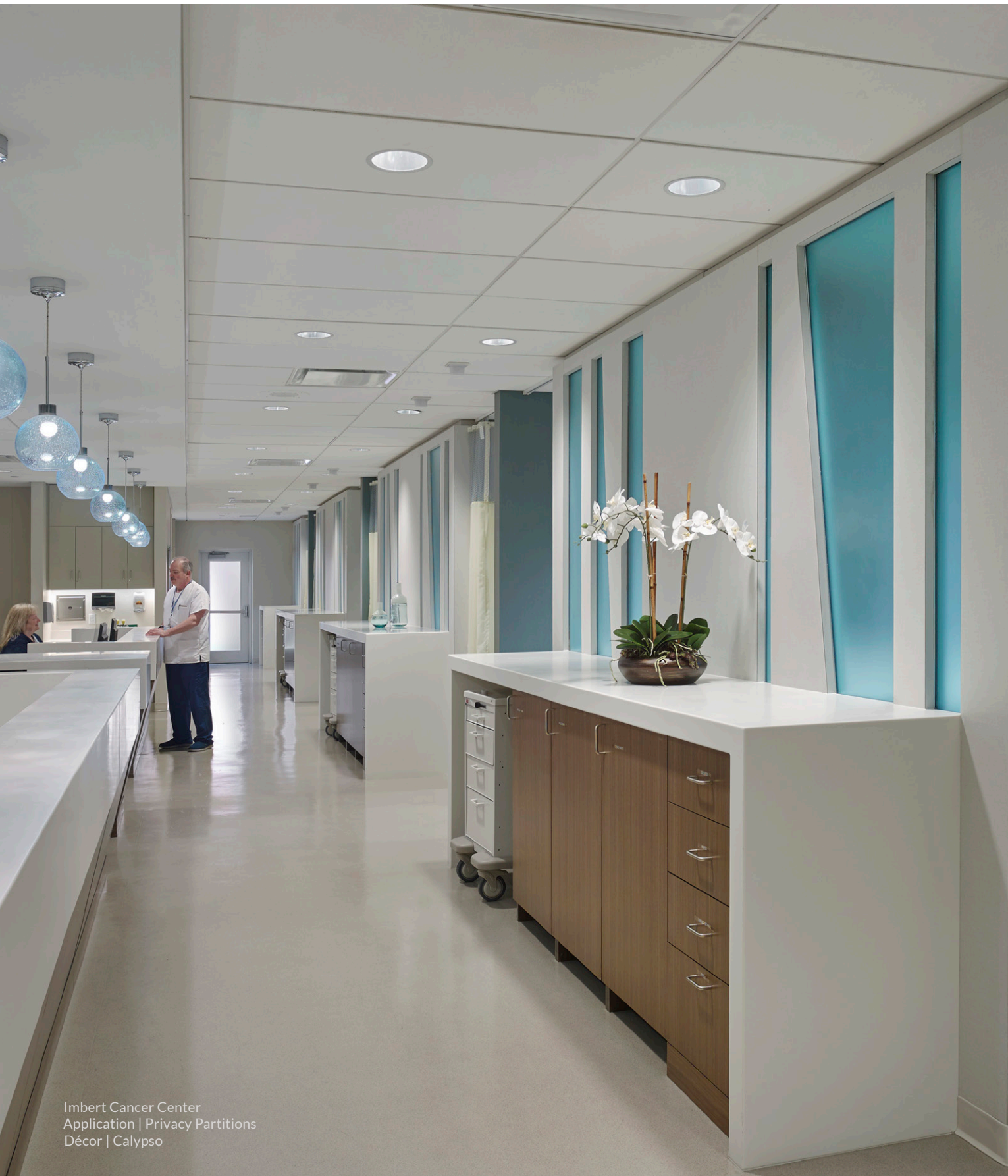
Imbert Cancer Center Application | Privacy Partitions Décor | Calypso