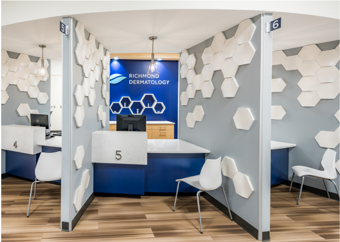
Richmond Dermatology Application | Wall Art Kuvio Shape | Roll Kuvio Finish | Shimmer Ash