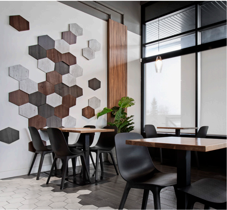
Hospital Cafeteria Application | Wall Art Kuvio Shape | Slide Kuvio Finish | Concrete, Walnut, Shadow

Kuvio Dimensional Wall Tile features crisp, geometric shapes in a stunning collection of natural finishes, including rich woodgrains, concrete, and stone. The lightweight tiles arrive fully finished, making installation simple, quick, and economical. Shapes can be arranged in a variety of patterns and each individual tile is ultra-lightweight, allowing for placement on walls, ceilings, partitions, and desk fronts.