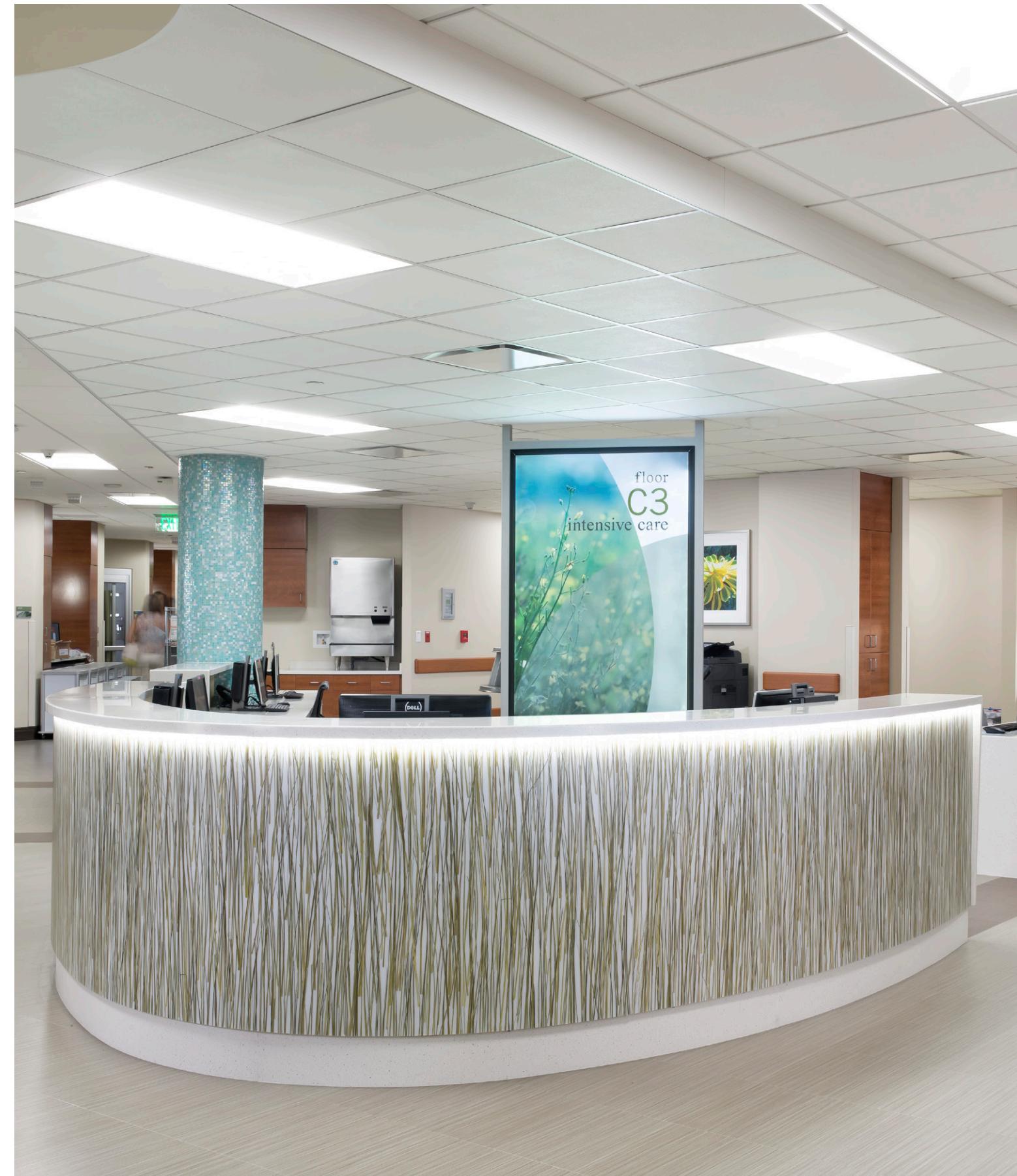
Chandler Regional Medical Center Application | Wall Protection ( on desk ) Décor | Coastal + Cameo

The Wall Protection line features a curated selection of natural and neutral décors, a Class A fire rating, and an easy to clean, durable satin finish, making it ideal for healthcare environments.