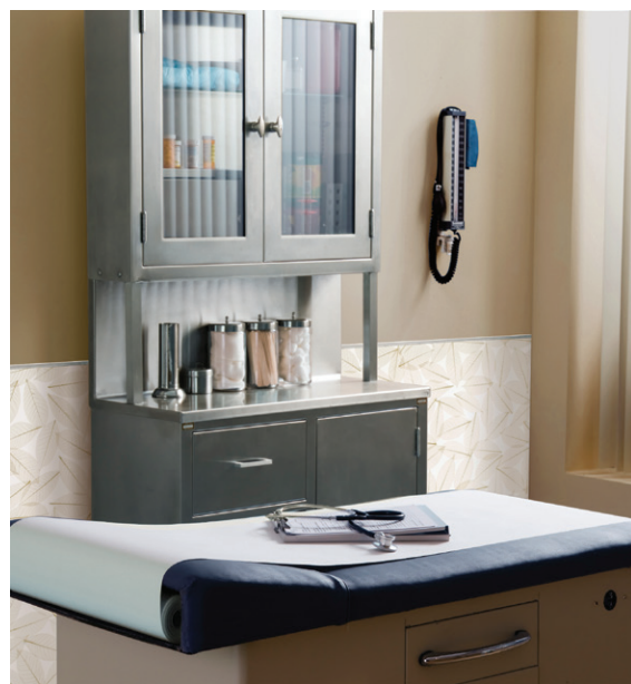
Exam Room Application | Wall Protection Décor | Natural Leaves + Antique White