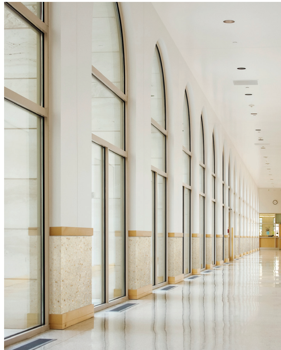
Hospital Hallway Application | Wall Protection Décor | Paper Leaf + White Opaque