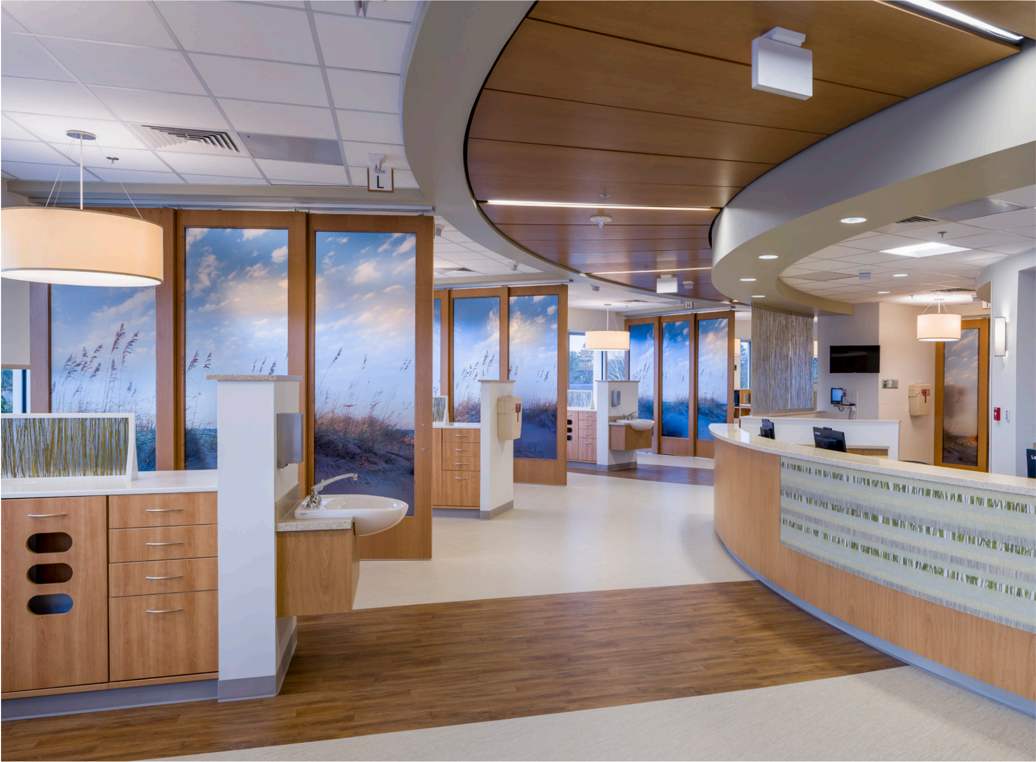
Carolina East Cancer Center Application | Sliding Privacy Panels Décor | Custom Digital Print Application | Desk Front & Desk Privacy Partitions Décor | Coastal Light