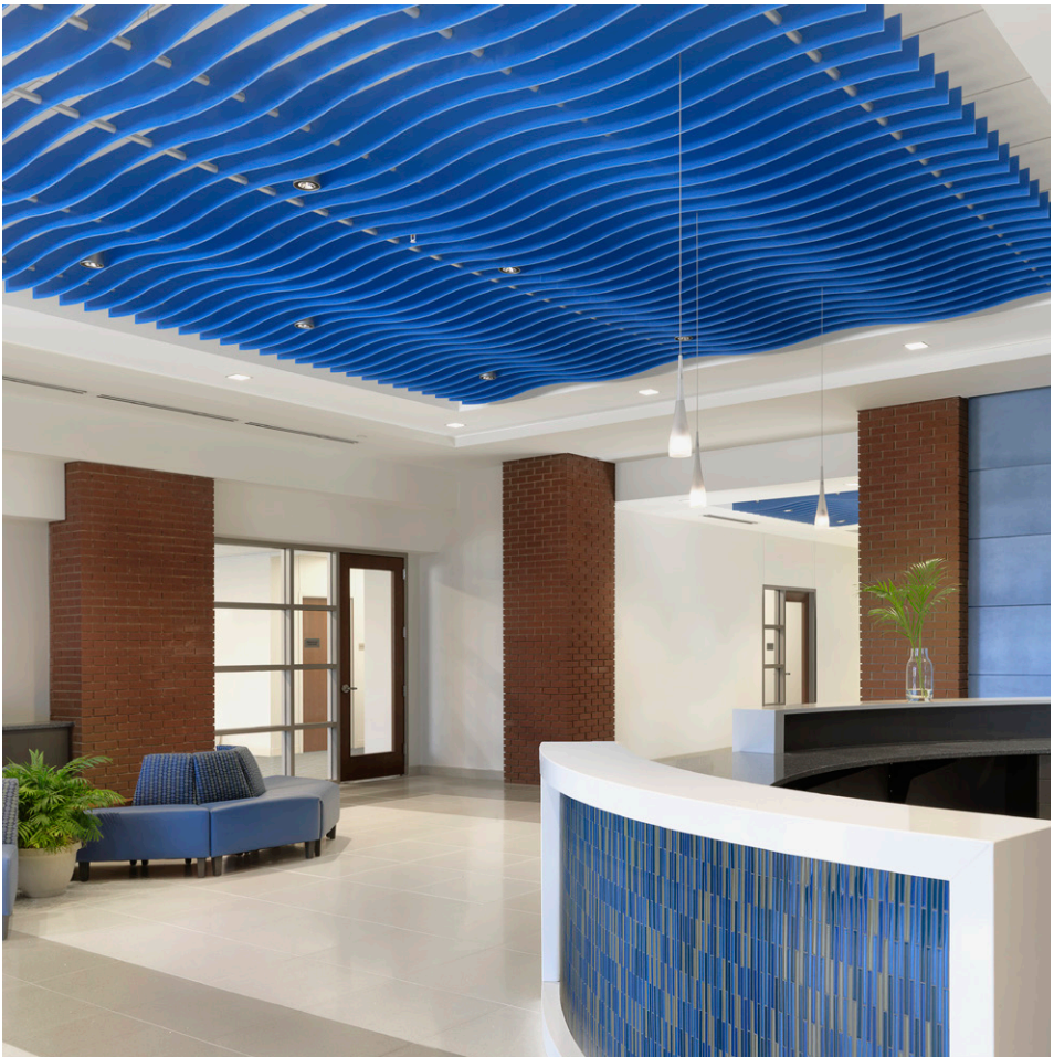
St. Charles Early Childhood Center Application | Ceiling Feature Décor | Denim