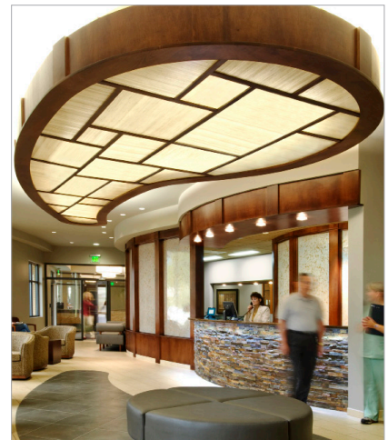
Carolina Dermatology | Design Firm: Panageries Pearl Milan with Illume Resin

Use for applications where you are specifying lighting solutions for a uniform look.