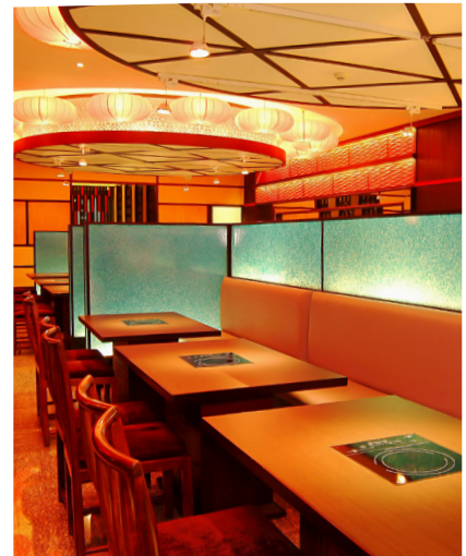
Restaurant - Privacy Booth Partitions METALLIC & GLASS | Blue Topaz Recycled Glass with ChemShield

Use for vertical applications where panels are cleaned with chemicals routinely, or are in high-touch areas. For horizontal applications such as tabletops or countertops, use Lumiguard.